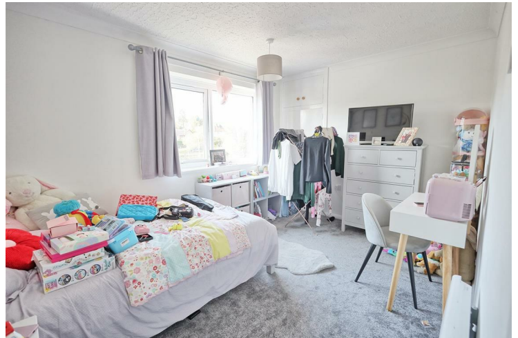
BEDROOM TWO 13'1" x 9'2" (4 x 2.8)