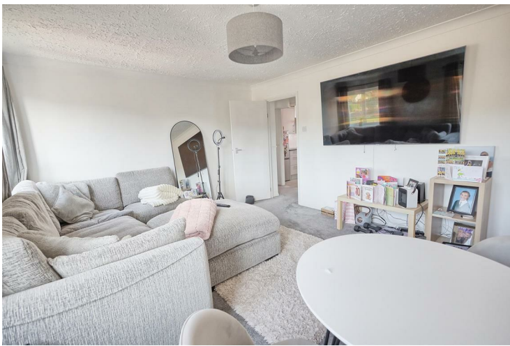
LIVING ROOM 16'1" x 12'8" (4.92 x 3.87)