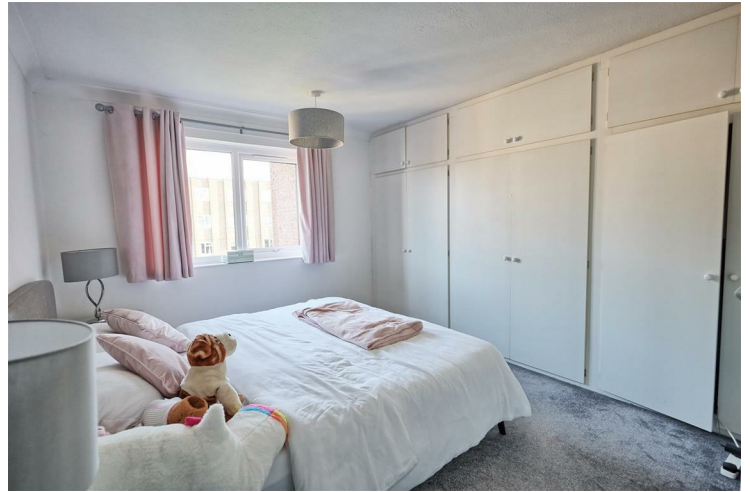
BEDROOM ONE 12'7" x 9'10" excl wardrobes (3.84 x 3 excl wardrobes)